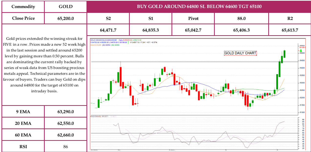
Chart for the day